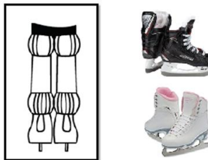
MOLDED PLASTIC SKATES ARE NOT PREFERRED AS THEY DO NOT PROVIDE GOOD FIT OR SUFFICIENT ANKLE SUPPORT.